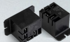
EXTERNAL RELAY 30A